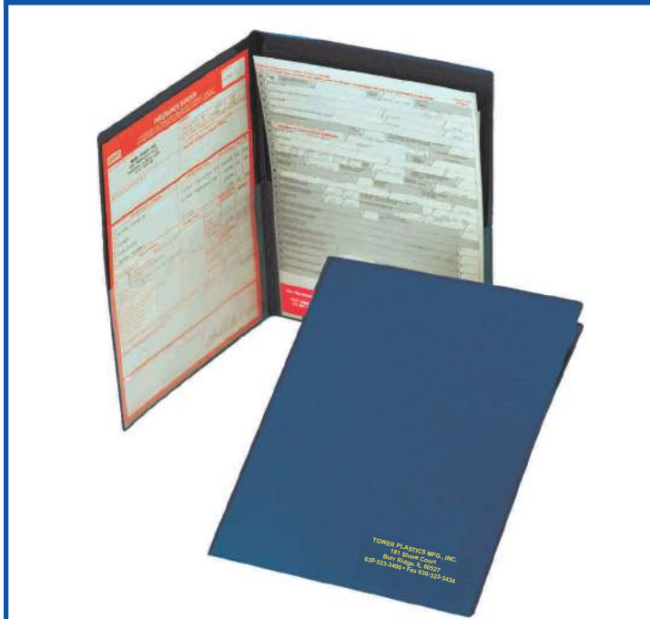
No. 290 PRESENTATION FOLDER