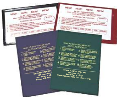
No. 60 4" x 5 3/4" WITH "WHAT TO DO IF YOU ARE IN AN AUTO ACCIDENT" AND YOUR PERSONALIZED IMPRINT