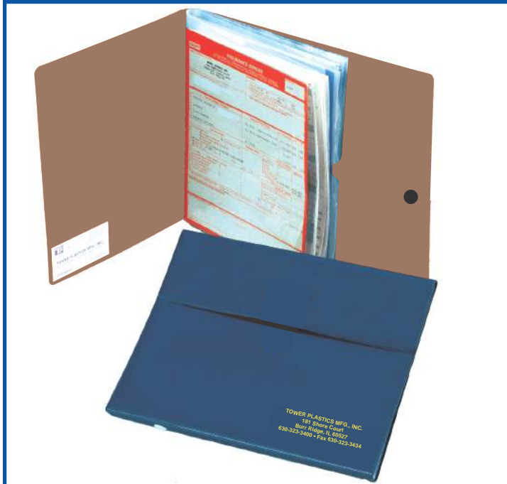
No. 1000 POLICY PORTFOLIO