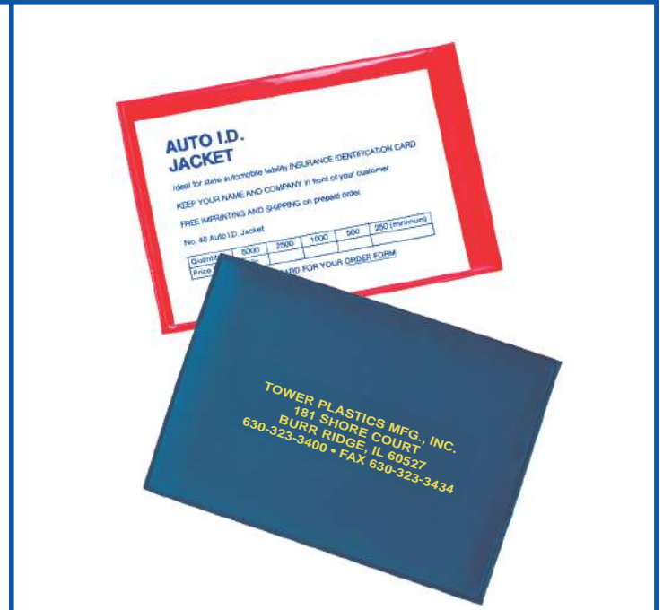
No. 40 AUTO ID JACKET

SPECIALISTS IN IMPRINTED PRODUCTS FOR INSURANCE