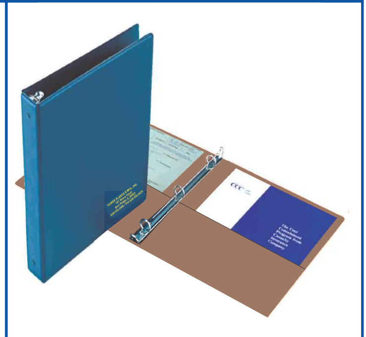
No. 900 PRESENTATION BINDER