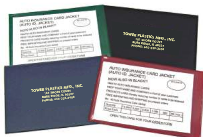
No. 40 4" x 5 3/4" OUR BEST SELLING JACKET

Ideal for auto insurance cards. Keeps YOUR NAME AND COMPANY in front of your customers. FREE 4 LINE IMPRINT in GOLD in our standard type when all pieces are printed the same. Available in BLACK, NAVY BLUE, RED and GREEN.