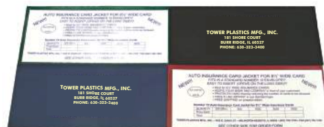
No. 72 4" x 8 7/8" HOLDS AN 8 1/2" WIDE CARD AND STILL FITS IN A No. 10 ENVELOPE. OPENS ON LONG SIDE FOR EASY INSERTION