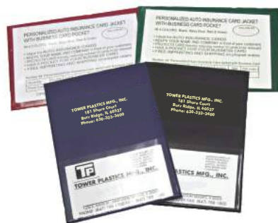
No. 44 4" x 5 3/4" WITH BUSINESS CARD POCKET